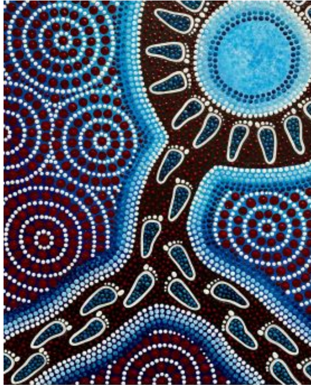
Title: Journey Together