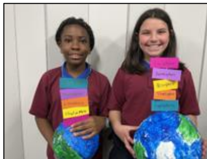
The Year 4 Team