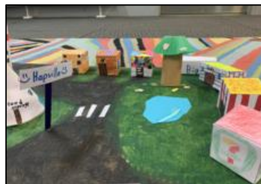
The Year 4 Team