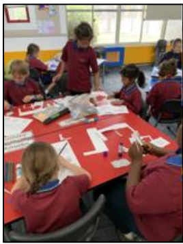
Students have also been exploring place value in Mathematics. Here are students creating a critter and calculating the value of these.