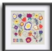
Designed by kids at Sydney Children's Hospital.