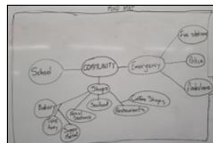
The Year One Team