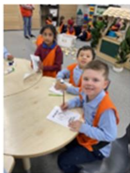
Making passports in the comets

Here is a brief look at what we had happening in week 1: