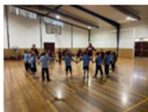
Getting ready for our yarning circle in the rockets room