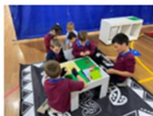
Lego creations in the rockets room