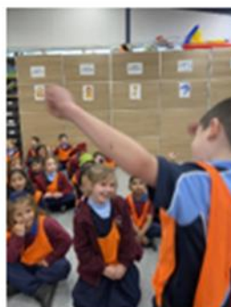
Playing charades in the comets