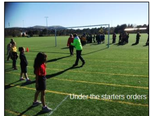
Under the starters orders

The times for all the heats have been collated and the 3 fastest times for 100m, 200m and the 400m races will earn a place ribbon. The 3 longest distances for each age category in shot put and discus will also be rewarded with ribbons. The times and distances will be used to determine how many students have qualified to go to the zone athletics carnival next term.