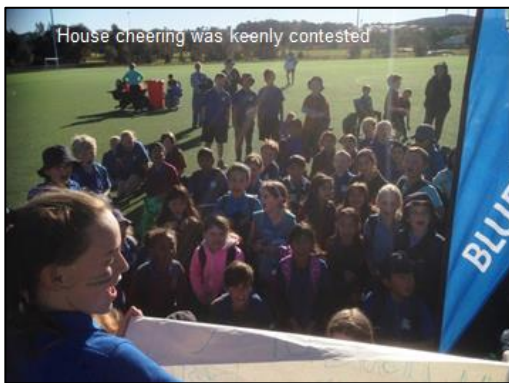
House cheering was keenly contested

Our annual Athletics Carnival was held on Thursday 1 June. After a cold start we had sunshine all day. Overall, it was a successful day with very high student participation numbers. This meant that some events like the 800m and 12 year old 100m had to be completed after the carnival day. The students enthusiastically cheered on their classmates, friends and fellow participants from their house. Such high participation earned many points for each student's house resulting in a very close competition!