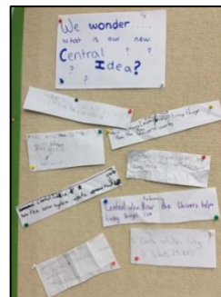
The Year 3 Team