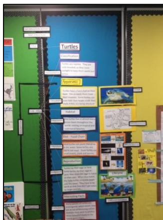
Turtle Fact Wall

Each classroom has an example of an information report structure to guide students along with an A sample that students can refer to. These displays help the students to improve their communication skills when constructing texts.