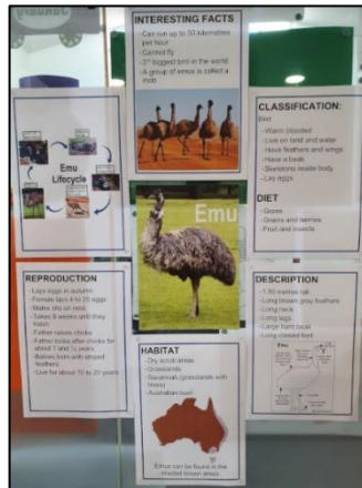
Emu Fact Wall