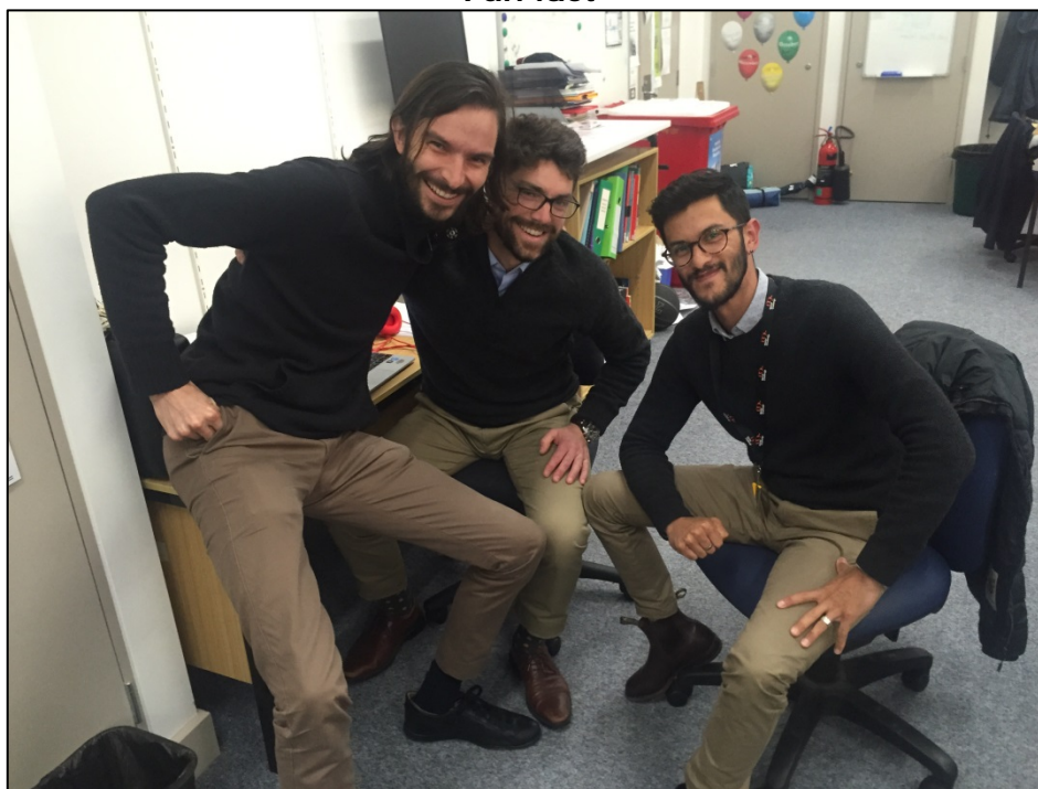
Staff collaboration to the max!